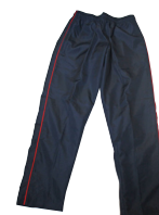
Sports Tracksuit Pants, K-12 (4339TISX001U)