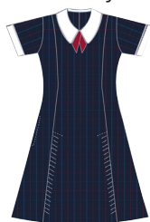
Dress, K-10 (4339D384) *matched with Dress Tab Tie, Red, K-6 (4339TBOW022R)