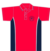
Red & Navy Shirt, K-6 (4339P281SE)