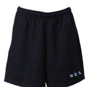
Sports Shorts, Microfibre, K-12 (4339SM23UE)