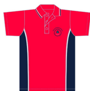
Red & Navy Shirt, K-6 (4339P281SE)