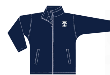
Soft Shell Jacket Kids Style (4339J740ME, Style: J740K) Ladies Style (4339J740LE, Style: J740L) Adult Style (4339J740ME, Style: J740M)