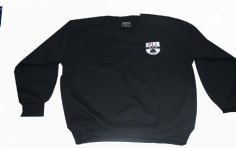
Sloppy Joe, K-6 (5310VN)