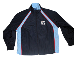
Sports Tracksuit Jacket, K-12 (4339ZIX2330E)