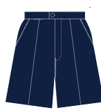
Male Tailored Shorts, Men Sizing, Year 7-12 (4339SHT024ME) or Male Tailored Shorts, Youth Sizing, Year 7-12 (4339SHT024YE)