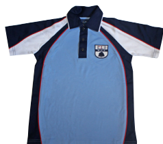
Sports Polo Shirt, K-12 (4339PRM286DE)