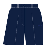
Female Tailored Shorts, K-12, Adult Sizes (4339FS027E)