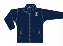
Soft Shell Jacket Kids Style (4339J740ME, Style: J740K) Ladies Style (4339J740LE, Style: J740L) Adult Style (4339J740ME, Style: J740M)