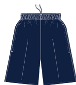
Elastic Shorts, K-10 (4339LLSE)