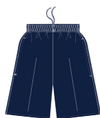
Elastic Shorts, K-10 (4339LLSE)