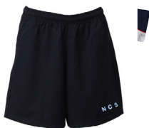
Sports Shorts, Microfibre, K-12 (4339SM23UE)